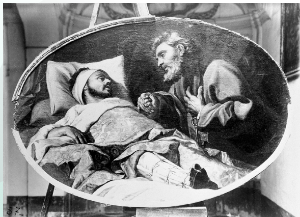
Photo of St. Ignatius in splints and speaking with St. Peter by Antoine de Favray.

Engaging with the accounts of his young adulthood, we see Ignatius to be quite human. He was a man of his time and of his society, to a certain extent caught up with the vanity and violence of a world that promised