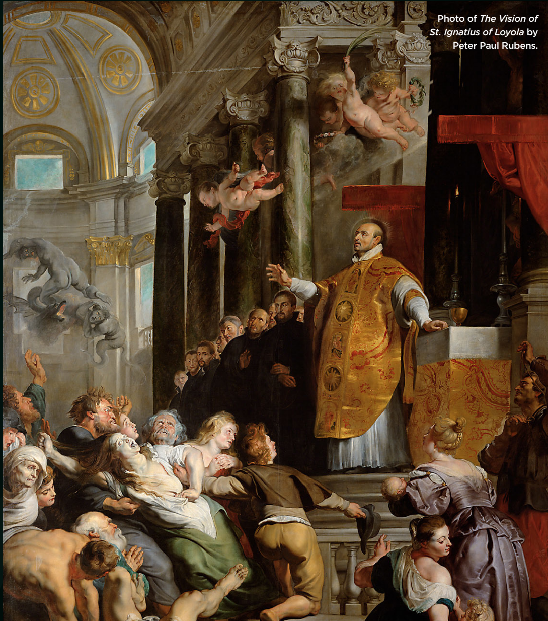
Photo of The Vision of St. Ignatius of Loyola by Peter Paul Rubens.