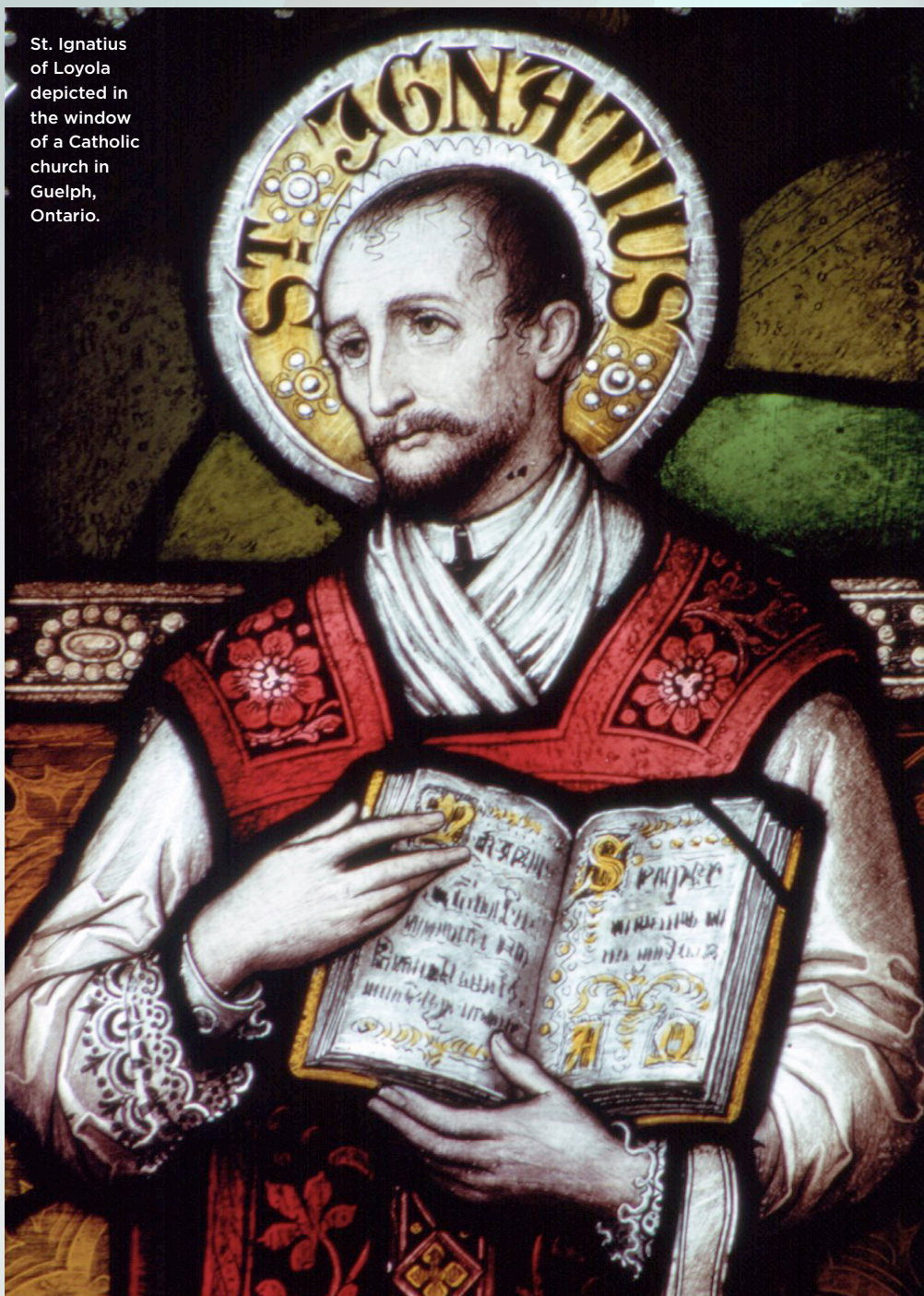
St. Ignatius of Loyola depicted in the window of a Catholic church in Guelph, Ontario.

“Many of our family members and friends, many men and women of our community as a whole, have faced not only a physical virus that brings sickness and death, but the great suffering that comes through depression, anxiety, mental illness, addiction, and the wounds of broken relationships.”