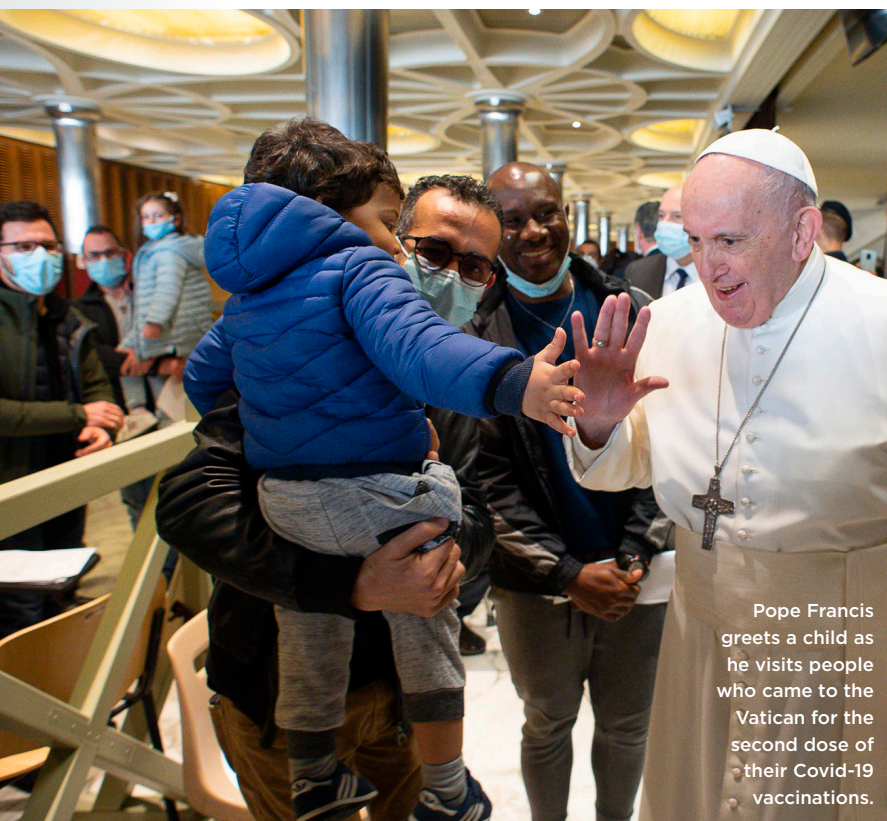
Pope Francis greets a child as he visits people who came to the Vatican for the second dose of their Covid-19 vaccinations.

Aside from making a pilgrimage to the Holy Land, Ignatius spent roughly the next 12 years in studies, primarily at the University of Paris. Although he did not achieve high intellectual or academic success, his