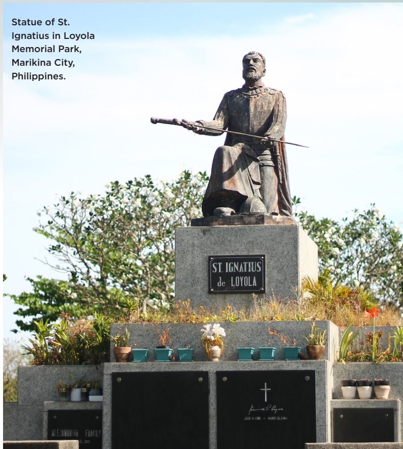
Statue of St. Ignatius in Loyola Memorial Park, Marikina City, Philippines.

world, being instructed in the ways of the royal court, as well as receiving an education, all in the hopes of one day receiving an official position in the court.